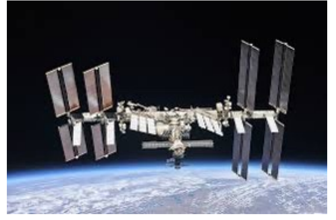
Sky Event Almanacs